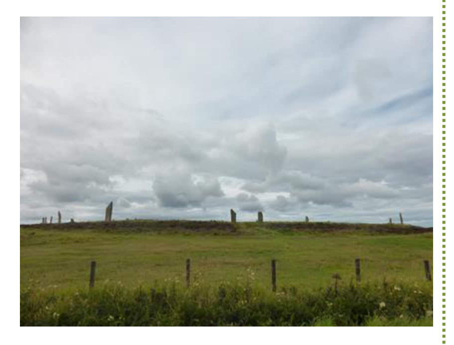
Ring of Brodgar

the sea is quite cold for us, Mediterranean people! Orkneys are rich of history and nature, there are prehistoric sites all over the islands, one of my favourite is the Ring of Brodgar. You can walk through paths almost in every part of the islands; and buses will stop to give you a ride or you can also hitch hike. All this beautiful history is surrounded by an incredible Nature, there are flocks of sheep everywhere and on North Ronaldsay there is a unique breed of sheep that comes directly from prehistory and there is one of the best bird observatory in Europe.